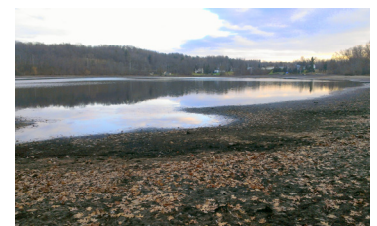
The drawdown is complete

All applications must be received no later than February 15, 2013 to be considered.