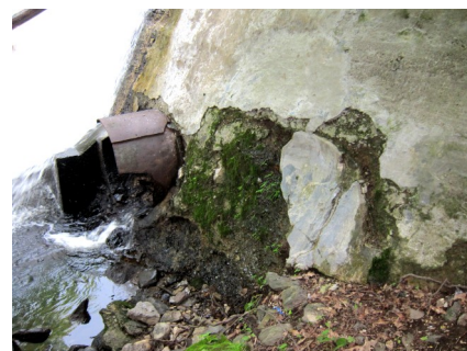
>>>> View of surface damage outside the sluice pipe