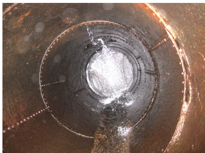
<<<< View of leaks inside the sluice pipe